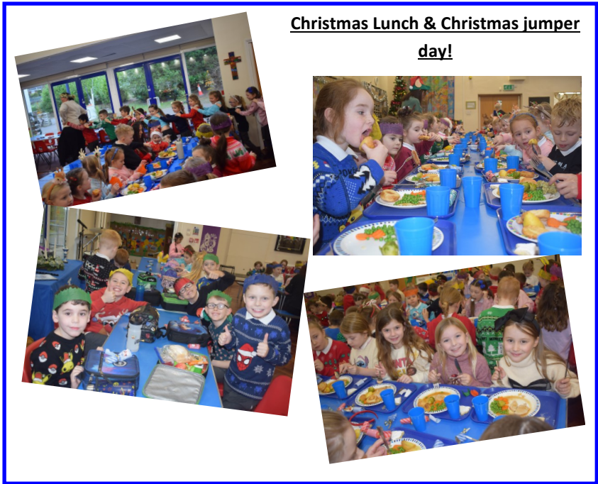
Christmas Lunch & Christmas jumper day!